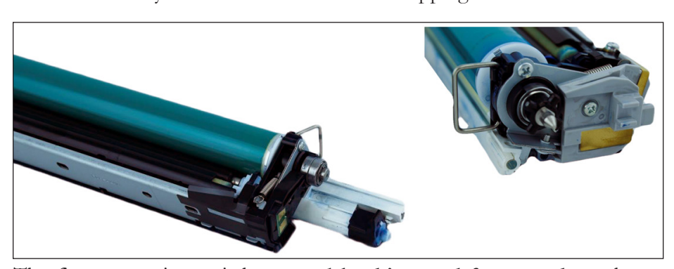
The first generation unit has metal backing and framework as shown above and will result in a $5 disposal fee for each unit we receive.