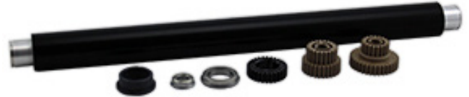
MX-753 w/4 fingers

BIG SAVINGS, UNIQUE FEATURES, AND SECOND-TO-NONE PERFORMANCE FROM OUR FUSER ROLLERS.